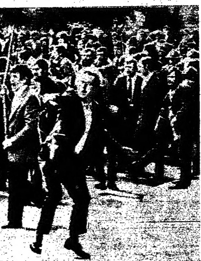
Catholic demonstrators throw rocks and bottles at British troops in Belfast on Sunday. The soldiers replied with rubber bullets, injuring several.

BELFAST. — A precarious two-week peace in Northern Ireland lay shattered yesterday with seven people dead after a night of shooting and bombing that sparked fears of civil war in the battle-scarred British province.